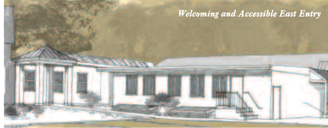
Welcoming and Accessible East Entry